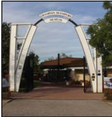
The Entry Archway to the Grampian Transport Museum in Scotland

In the last couple of years, we have taken some side trips between bouts of hiking, giving our feet a chance to recover and our hiking duds a chance to be restored to at least moderate social acceptability. In the autumn of 2016, for instance, some dodgy Scottish weather dislodged us from the Cairngorm highlands down into Alford, Aberdeenshire for a visit to The Grampian Transport Museum. Now, we don't often think of Scotland as a hotbed of motor manufacturing, but Rootes and Chrysler actually made Hillman Avengers, Chrysler 180s and Sunbeams there. Also, Volvo has had a bus and truck manufacturing plant near Glasgow. And just so you know, Scottish cities and vacation spots were early users of motorised public transport. Glasgow in particular is one of the few cities in the UK outside London that has a subway rail system – in fact it is the third oldest in the world after London and Budapest. It's known locally as the "Clockwork Orange" because of the circular route and the colour of the trains.