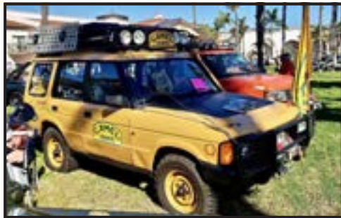
A Land Rover Camel Trophy Vehicle

The red 1939 SS100 Roadster was the first car to catch my eye, followed by a XK120 LT1 Roadster, a 1951 Land Rover Series One 80, a Land Rover Camel Trophy Vehicle, an XK150 Roadster, an XK120 FHC and an XK140 OTS.