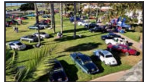
Jags on the lawn in Santa Barbara

The day announced itself with more blue skies and sunny weather, a perfect day for a Concours. By 9:00 AM, 48 Jaguars and several Land Rovers were ready to be judged. With apologies to Jaguar E-Type lovers, I spent most of the morning speaking with the owners of older classic Jaguars, which are, in my opinion, like a classic Chanel suit – they never go out of style.