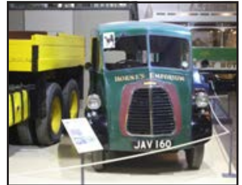
A Morris delivery van

Every Highland farmer's vehicle of choice, the Land Rover, is also well represented. There are speciality vehicles including a nice old Morris van, buses, trams, steam engines (which were invented by a Scotsman of course - James Watt), American cars, motorcycles, bicycles and the envy of any 1960s "mod" - a Lambretta scooter.