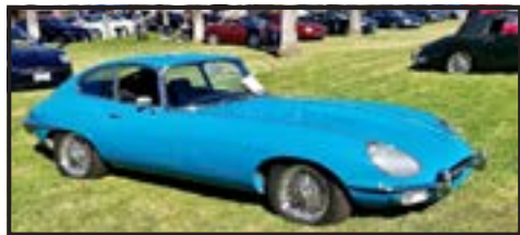
E-Types just don't seem to get old