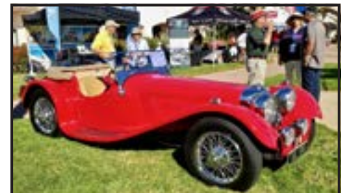
A stunning SS100

The day announced itself with more blue skies and sunny weather, a perfect day for a Concours. By 9:00 AM, 48 Jaguars and several Land Rovers were ready to be judged. With apologies to Jaguar E-Type lovers, I spent most of the morning speaking with the owners of older classic Jaguars, which are, in my opinion, like a classic Chanel suit – they never go out of style.