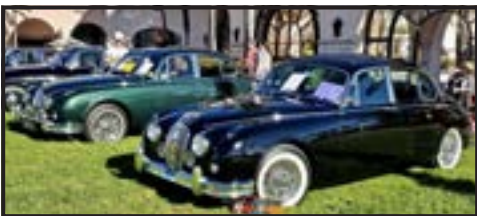
Some beautiful Mark IIs grace the show field