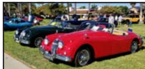
An XK150 OTS or two

I always learn something new at Jaguar events. This Concours introduced me to car color names that I was previously unfamiliar with, such as Dark Opalescent Green, Opalescent Dark Blue, Imperial Maroon and Warwick Blue. All have now been added to my Jaguar vocabulary.