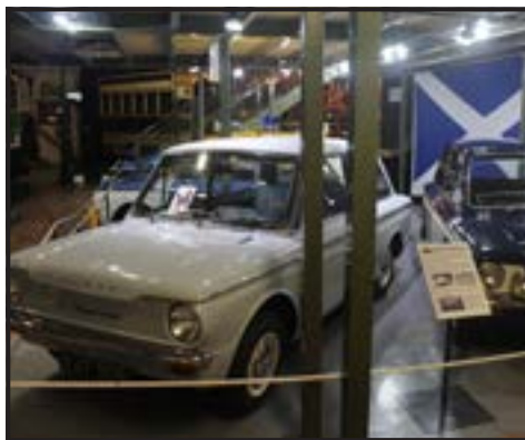
Scottish Hillman Imps from the 1960s