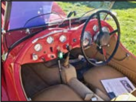
SS100 cockpit and dashboard

The red 1939 SS100 Roadster was the first car to catch my eye, followed by a XK120 LT1 Roadster, a 1951 Land Rover Series One 80, a Land Rover Camel Trophy Vehicle, an XK150 Roadster, an XK120 FHC and an XK140 OTS.