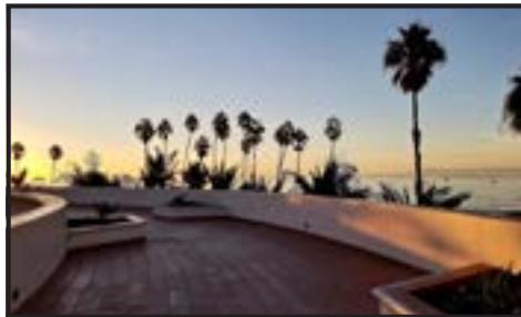
Sunset in Santa Barbara

Santa Barbara is often called the Riviera of the Western United States and with spectacular views of the Pacific Ocean and blue sky, sunny weather, the area did not disappoint. Can it get any better than this? Well as the days unfolded, the answer to this question turned out to be: yes it can, and, yes it did.