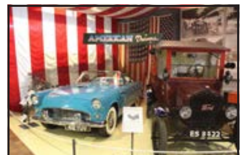
Even some American cars