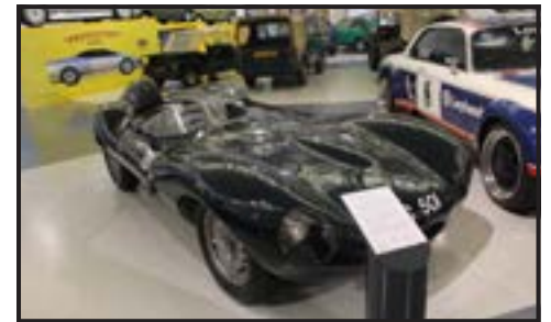
The prototype D-Type

Next time we're in the Midlands we might check out the National Motorcycle Museum in Birmingham. If we get to the South Coast soon we will take a look at the National Motor Museum near Southampton. We might even visit Goodwood. There are plenty more of these places, too. There's even the Morgan factory!