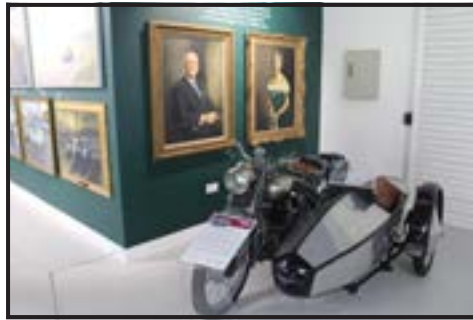
A Swallow Sidecar, plus portraits of William Lyons and his wife