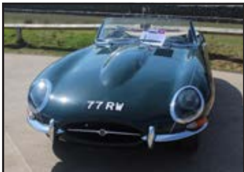
The second E-Type ever made — registration 77 RW

A few highlights from The Jag collection were: