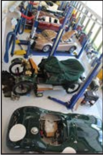
Lots going on in the workshop

So many cars that it was impossible to see them all in one day. In the video room there was a loop of numerous promotional and documentary films from the past that brought back a lot of memories. Plenty was happening in the workshop too.