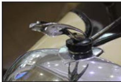
An SS hood ornament

So, we visited two very different motor museums, both worth the trip. There's no doubt that the collection at Gaydon is easier to find, being in middle of England close to motorways and about 2 hours from London. It's big and full of interesting cars and exhibits, even without all of the other marques (I have heard anecdotally