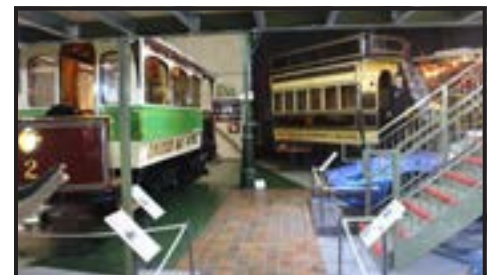
A variety of trams