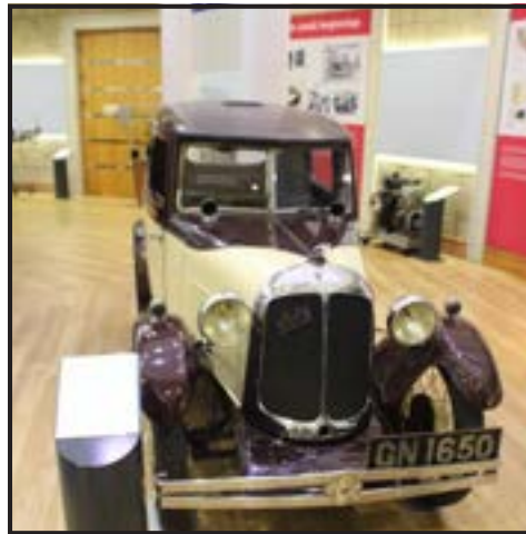
An Austin with SS bodywork