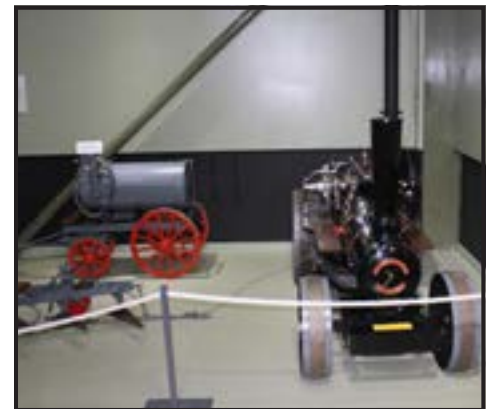
Some steam engines