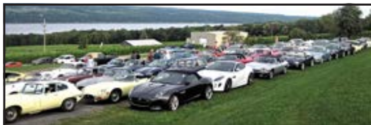
Our starting grid before we got into single file

Friday turned out to be a little more intense. At an unreasonably early hour (pre 10 AM), we all convened at Chateau Lafayette Reneau, yet another winery (I detect a pattern here), the starting point for a somewhat more elaborate rally tour. This time, about 100 Jags showed up, and after coffee, pastries and the obligatory car lies, we all set off in a single file of 100 Jaguars for a 70-mile romp through the lovely rolling Finger Lakes countryside. Thank God for the low traffic density!