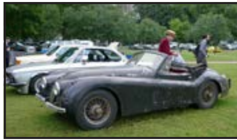
Essence of a barn find, or a restoration waiting many years to begin.

But among the 30,000 people expected to visit that day, there were some really interesting stories. For instance, while chatting with a group of three older gentlemen, I commented on the breadth of cars at the show and mentioned that they went from a 2018 Ferrari, obviously in excellent condition, to a 1953 Jaguar XK120SE barn find in unrestored condition. One of the fellows commented that the Jag was originally his car, bought for $400.00 in 1960 with the intention of restoring it over the years. But it never happened and life caught up to him. He no longer had the interest, time or energy to actually tackle the project. So, he recently had given the car to a relative who was intent on the restoration, again someday. By the way, the car won second place in the British Class. Pretty cool.