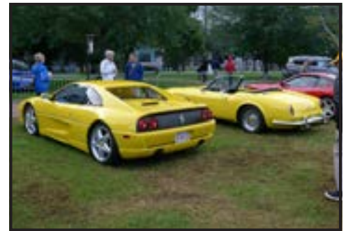
The author's Ferrari, GIALLO, shares some car stories with its pals on the show field.