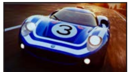
A rendering of the Ecurie Ecosse LM69 prototype