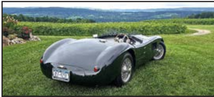
XKC 009 contemplates the vineyards and rolling hills from former days of glory.