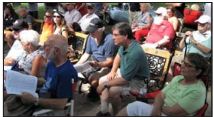
Jag owners from all over hang out at Jag FLX.

The Jag FLX show on Thursday was very relaxed and low-key. Perhaps sixty cars from a variety of clubs from Ontario, Pittsburgh, the Delaware Valley, Central Ohio, New Jersey, and Central New York showed up and were pleasantly spread out across Lafayette Park, a nice, shady village park, complete with bandstand, in downtown Watkins Glen. We all hung out and made very pleasant small talk, just like a church social.