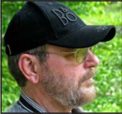
Your editor, looking for enlightenment.