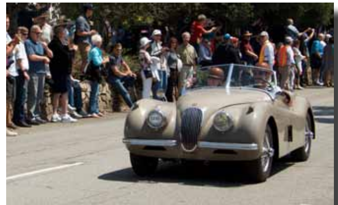
"Old Girl" on the Tour d'Elegance

A few problems faced them, however. Many of the improvements to make the "The Old Girl" survive the Mille Miglia rendered it questionable in a Preservation Class. Consequently, these modifications had to be reversed. Graham Engineering & Motorsport of Clifton, New Jersey, was tasked with the replacement of the vintage parts, many of which had been retained in storage.