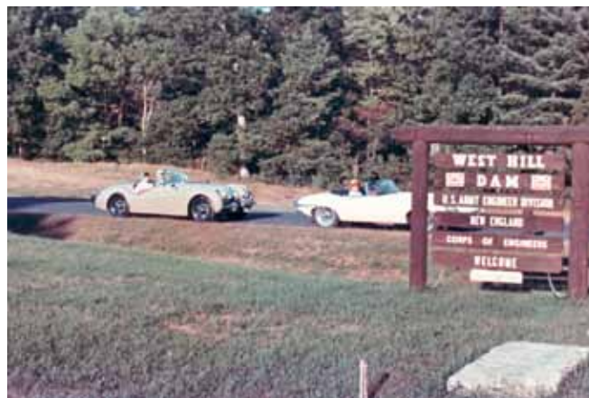
First NEXKA Gathering.