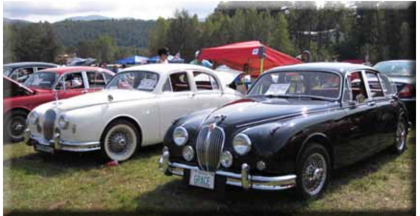
The Mark 1 (left) was the first small saloon, followed in 1960 by the Mark 2 (right)