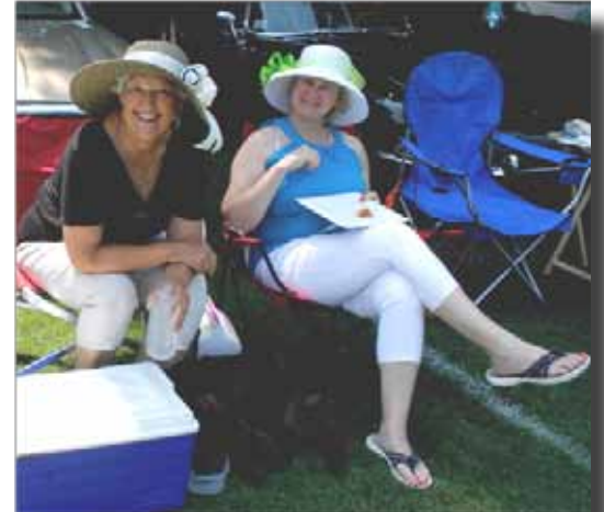
Bill Richardson photo