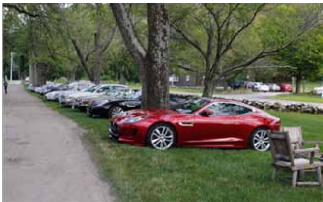
The Wayside Inn lawn teeming with cats.

Story by Rich Kosinski, photos by Bill Richardson