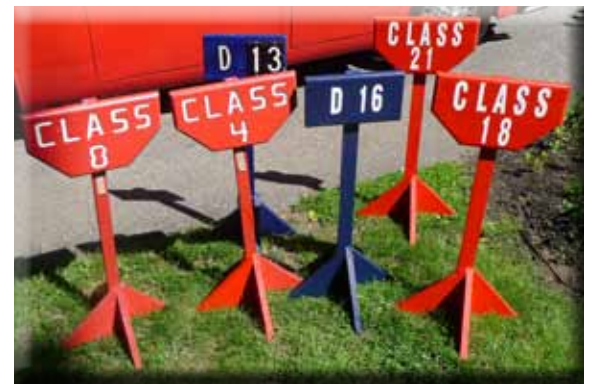
All ready for their day in the sun.