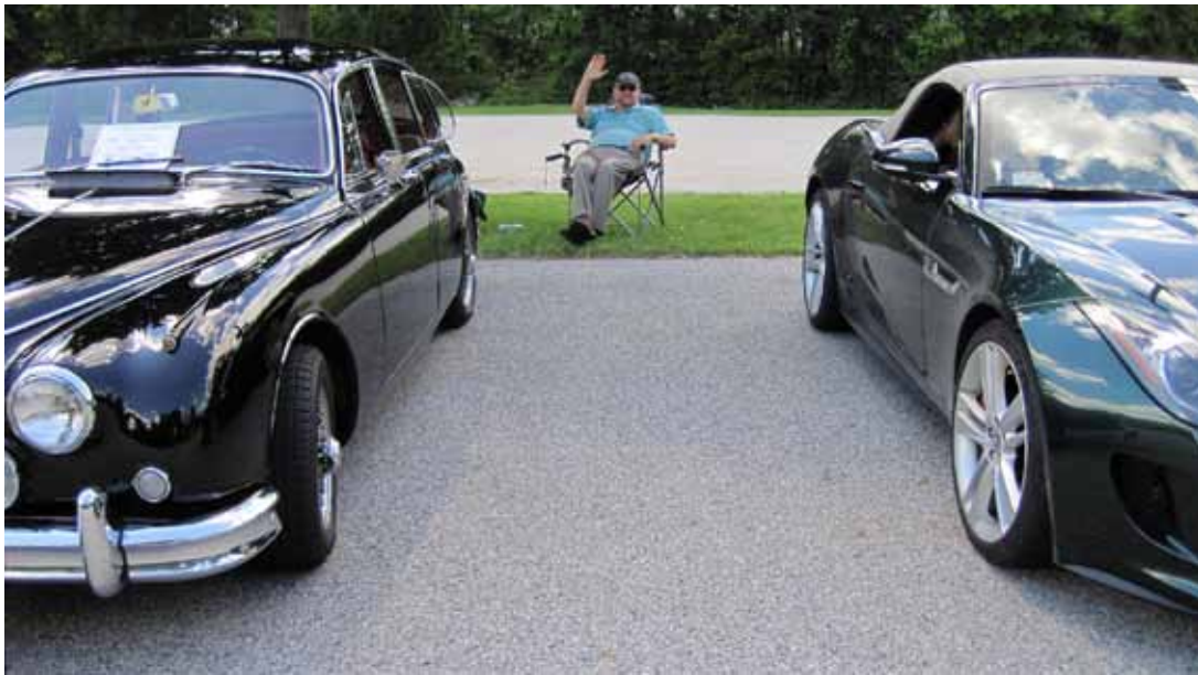
Summertime . . . and the livin' is easy!

[Secret foodie alert for JANE members only: On the way back, we stopped in Brattleboro for dinner at T J Buckley's, a tiny, six-table gourmet diner that takes their food as seriously and with as much passion as we take our cars. Simply awesome! Gotta have reservations. Absolutely worth it! Really topped off the day.]