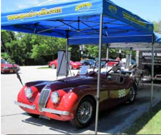
For sale: raced only on Sundays!