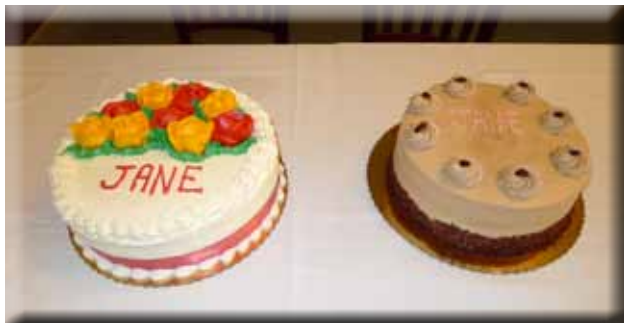
Doesn't get much better than cappuccino and rum cakes.