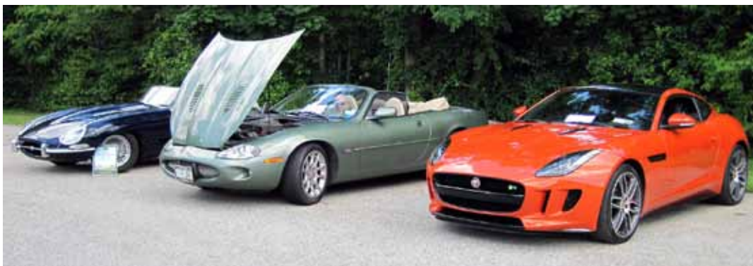
More Jags, E-Type, XK8, F-Type. Bless 'em!

In spite of all the weather foofaraw, there were sixteen Jaguars in attendance from around the northeast, along with a display trailer from Donovan's, of Lenox, featuring a vintage racing XK120 that is for sale (hint, hint),