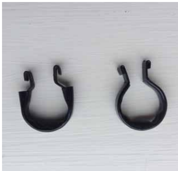
Photo 2 - The original clip is at left next to the shrink-wrapped new clip.