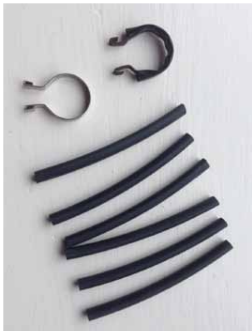
Photo 1 - The new "naked" clip is shown at top left next to the original clip. Below them are the shrink wrap pieces.

Total time, 15 minutes plus dry time; cost, $5.94, to make my car a little more correct. The shrink wrap comes in smaller sizes to suit the M and S clips. Photo 2 shows a new covered clip compared to the old.