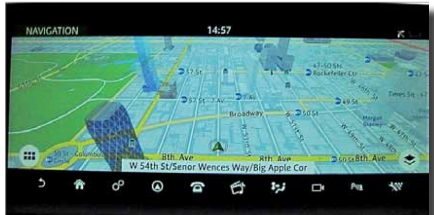
Live from New York! The navigation screen.