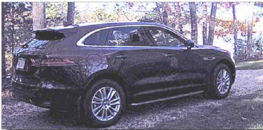
Slick as a brick, eh?