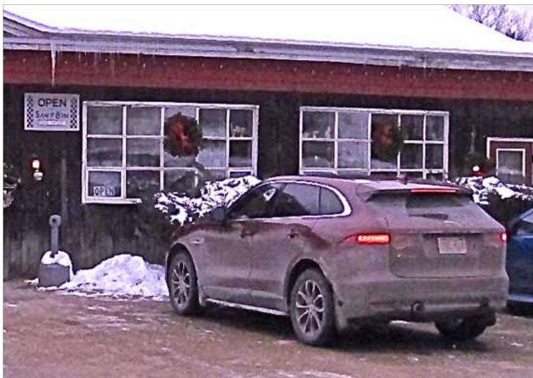
Green Mountain Pit Stop

A great addition to the Jaguar portfolio.