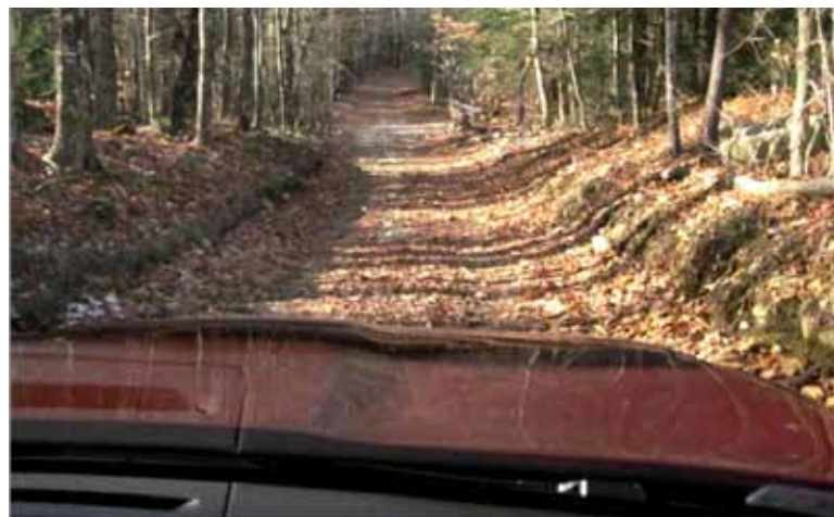
The Road Taken.

So, climbing into the F-Pace after an outing in an XJL or an F-Type (to say nothing of an E-Type!) is instructive. It is also a little disconcerting. What am I doing way up here? Why is everything so far away? Why are they still loading the boot? Egads, it must be full by now! Can this really be a Jaguar?