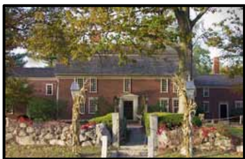
Longfellow's Wayside Inn 72 Wayside Inn Road Sudbury, MA 01776