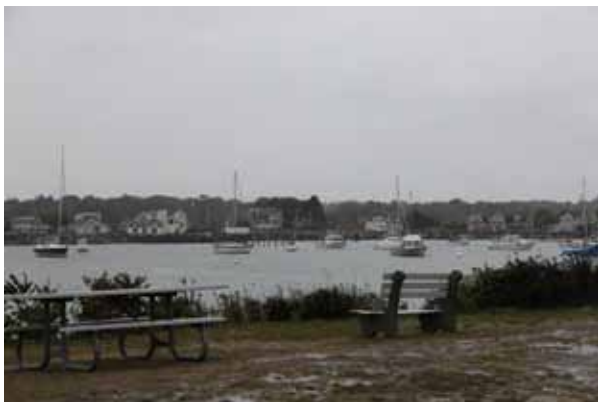
Harbor view, spectacular no matter the weather.