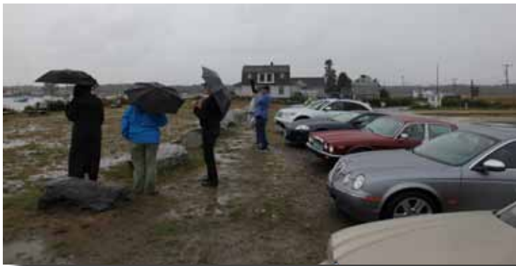
Die-hard JANE members brave the cold and raw to get a closer look at the ocean.

The return trip provided the opportunity for each Jag to stop at Stonewall Kitchen, When Pigs Fly Bread Bakery extraordinaire, and/or many of the Kittery outlets.