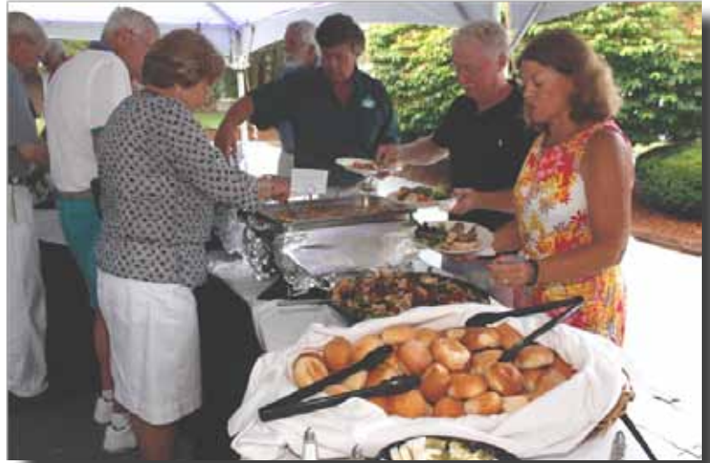
Attendees wrapped up the day with another fine dinner catered by the hotel.

There was plenty of beer, wine, and hors