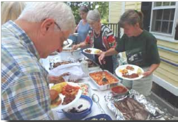
Bill Richardson photo