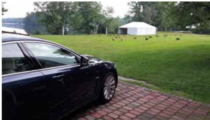
Even the geese trimmed the lawn (and fertilized it) in preparation for our Concours.