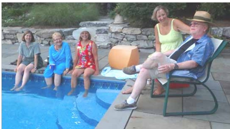
Bill Richardson photo