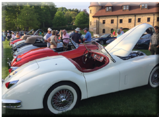
Jaguar XKs as far as the eye can see!