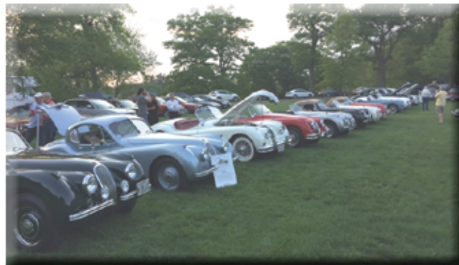
XK Jaguar heaven!