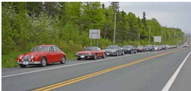
Regrouping in Canada after clearing customs.

Quebec City's strategic location guarding the St. Lawrence River means it is no stranger to centuries of invasions and conflict between the British, French, and Americans, so its citizens were well prepared for another invasion by the British (a friendly one by British cars, that is) when in June a veritable army of JANE members and their guests pushed 200 miles north from central Maine to Quebec City for a wonderful 3-4 day visit. The allure of Quebec City, a UNESCO World Heritage Site, and the hospitality of all whom we encountered made this among the largest and best JANE road trips ever.