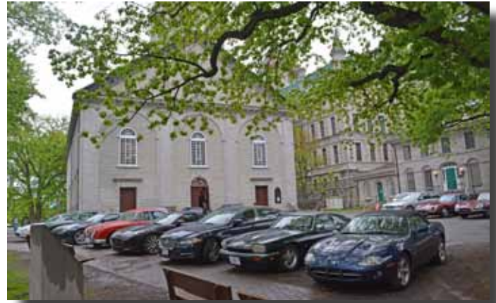
Secure parking at the Cathedral of the Holy Trinity - adjacent to the hotel.

Clarendon (the oldest operating hotel in the Old City) were awaiting our arrival and were on the streets directing traffic and guiding the Jaguars to our private, guarded parking at the Cathedral of the Holy Trinity, immediately adjacent to the hotel. The parking area was flooded with hotel staff who met us at our cars to handle our bags and guide us to a private check-in as our bags made their way to our rooms. We then had a little time to relax and check out our very nice accommodations before gathering in the bar area for a private reception with hors d'oeuvres and liquid refreshments (including JANE's own signature cocktail, the "Coventry Leaper"). Each member also received a souvenir glass engraved with the JANE logo to commemorate the tour. We then broke into smaller groups to sample the fine restaurants for which Quebec City is famous.