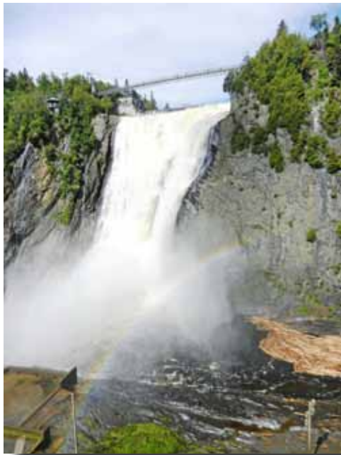
Montmorency Falls - higher than Niagra.

Friday morning, June 3rd, dawned with great weather. Our mission for Friday was to explore the city, so in the morning the club divided into two groups for a 2 ½-hour guided walking tour highlighting the history, architecture, and sights of the city. When we returned to the hotel, we were surprised by the number of visitors gathered in the church parking lot examining the cars. We should not have been surprised - the Cathedral of the Holy Trinity is a popular tourist attraction, its parking lot is in the hub of the Old City, and tourists found their way there to see the cars all weekend long. Our cars also provided a spectacular backdrop for the open air tables of several restaurants near the parking lot. The club members enjoyed talking about their cars with visitors and did so throughout our time in Quebec. We enjoyed the afternoon shopping and exploring the Old City individually or in small groups.