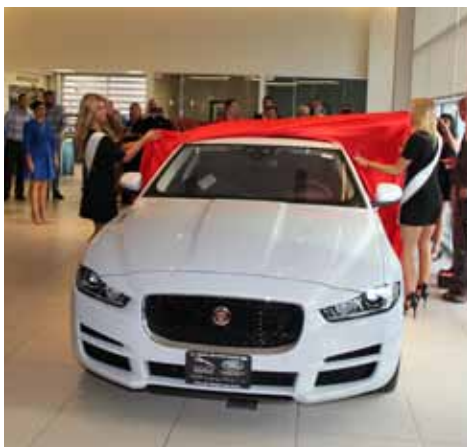
The XE (left) and the F-Pace unveiled.