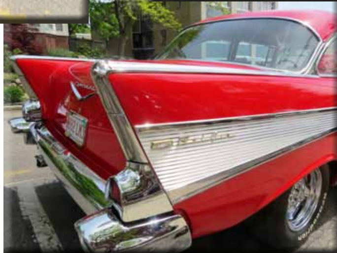
Other marques were represented as well, including the unmistakable tail fin of the '57 Chevy BelAir (right).