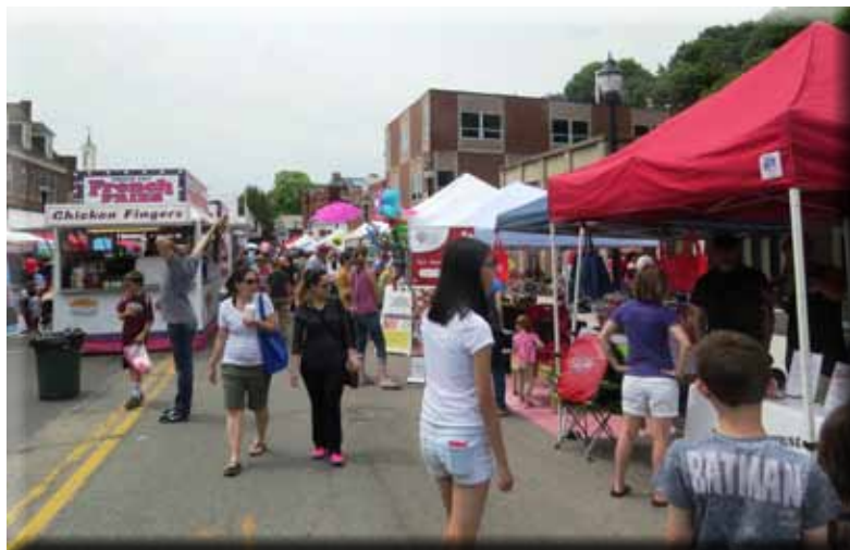
Belmont's Leonard Street was shut down for this event, and there were carnival rides for the kids, as well as vendors of all kinds for the adults.