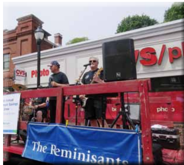
“What are we gonna tell your Mama? / What are we gonna tell your Pa? / What are we gonna tell our friends when they say ... ‘OOH-LA-LA?’” The Reminisants provided a great Boomer soundtrack for the event.