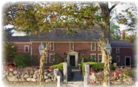
Longfellow's Wayside Inn