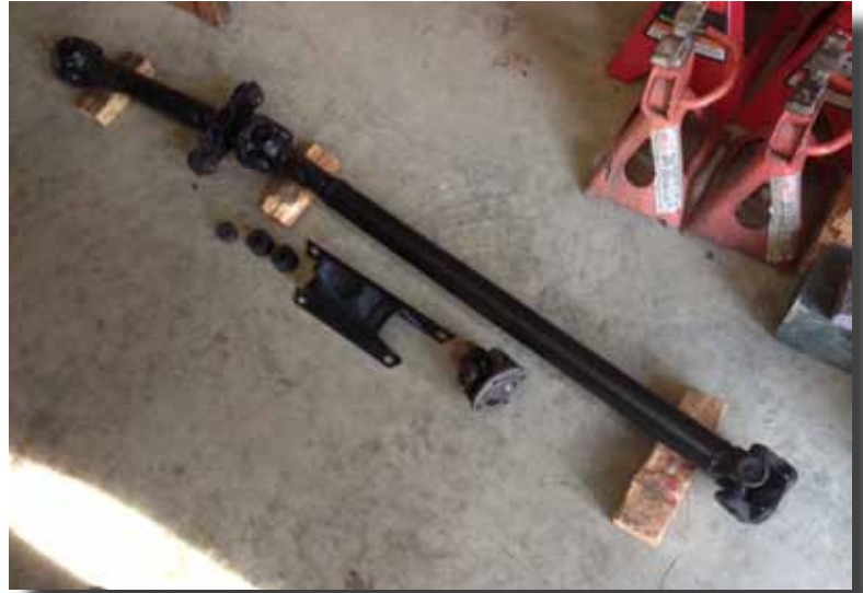
The out-of-balance driveshaft assembly plus old rear flange and O/D tail mounting rubber.

vibration's cause. With the front tires blocked and rear end on lift stands, I drove the car in 4th, watched the rear tires jump around, and then in turn removed each tire and brake drum looking for anything out-of-balance. Nothing. I rolled down the hill again with the same smooth result. I checked the driveshaft runout with a dial indicator borrowed from Steve Thomas, and even bought a simple dial inclinometer to check the angular relationship of the diff rear flange to the output shaft flange on the overdrive. All checked out. Then I called George Jones, another guru IMO. George said to get a second opinion of the driveshaft balance. I was suspicious of all the weights the first shop added, but I paid good money, and nobody had anything bad to say about them. PLUS, drive line balance shops are rare and hard to find!