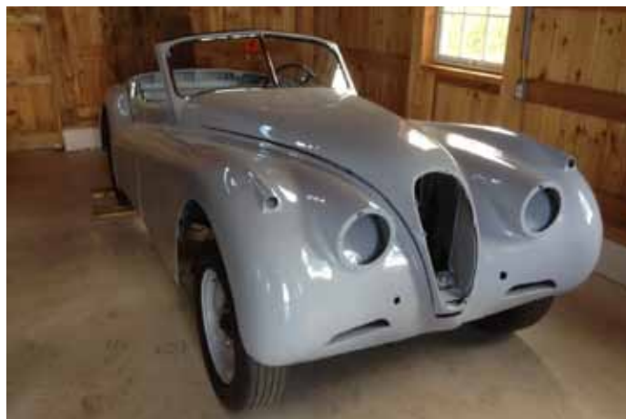
The next HUGE project.