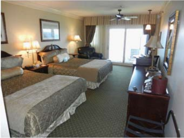
Typical room in the Oceanfront Lodge.

Do you ever wonder if your cars dream? I ask myself that question every time I go over to the garage and look at them sleeping under their covers. My guess is that my XK-120 is dreaming of the JANE trip to Bar Harbor in May! It may be freezing cold outside right now but, like most car lovers, I'm thinking about warmer weather and new adventures ... and May is only three months away! If you haven't already signed up for this trip you should do so SOON! Please register online at the JANE website or complete and return the attached registration form to verify your attendance.