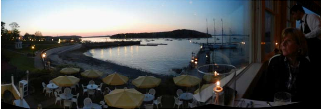
View from the Reading Room Restaurant at the Bar Harbor Inn.

Traditional rally plates will be prepared for each participating car. These and other additional expenses will result in a small assessment of $25 for the driver and $20 for each passenger in the same vehicle (the extra fee for the driver pays for the rally plate ... one per vehicle).