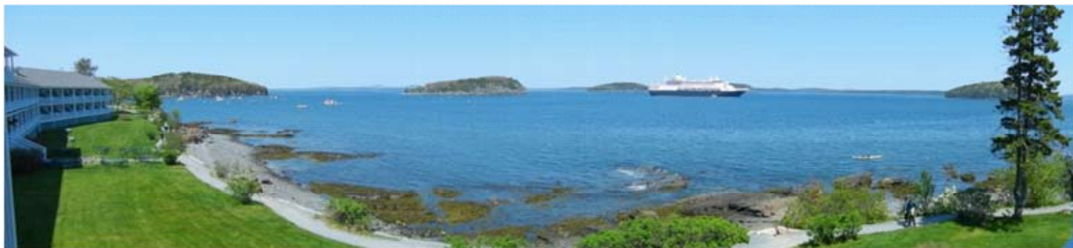
Panoramic view from the Oceanfront Lodge.

Individual room deposits, equal to one night's room rate, are due within 10 days of making a reservation. Individual deposits are refundable, less a $30 administrative fee, given notification 10 days prior to arrival date. Cancellations received with less than 10 days' notice are subject to a fee equal to one night's lodging. Cancellation insurance is available to all hotel guests at a cost of $25 per room and must be purchased on the day the reservation is made. This insurance allows the guest to change or cancel their reservation up until noon on the scheduled day of arrival with no penalty to the deposit.