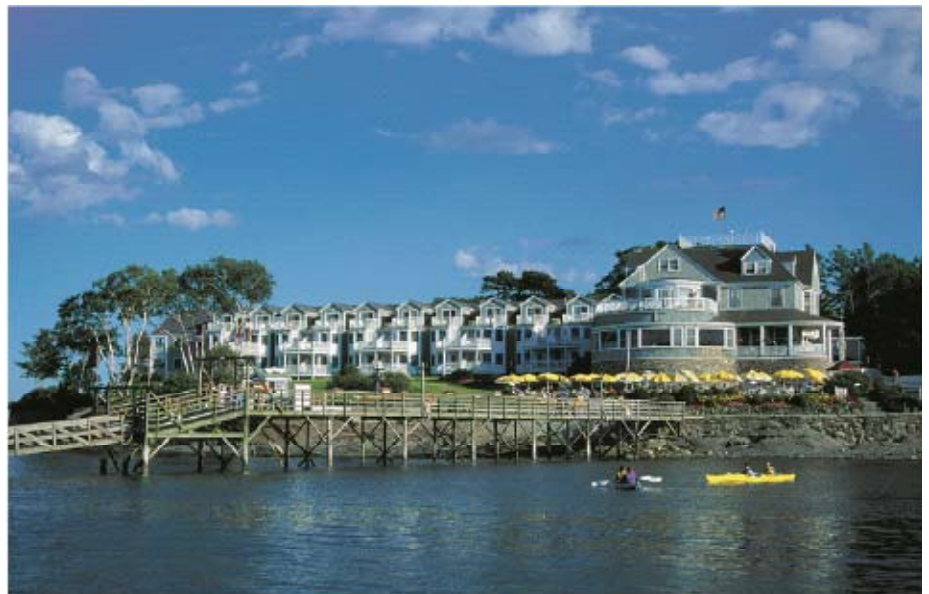
The Bar Harbor Inn

(Other less expensive lodging options are available off the waterfront or just out of town, but you would be separated from the group. Contact Ed for more information if you'd like to pursue this option.)