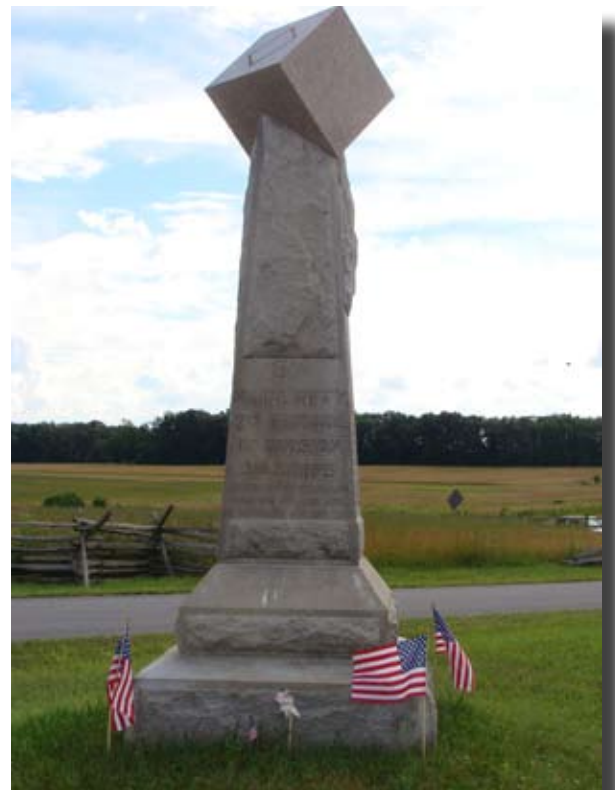
Right: After the celebration Your Editor visited Gettysburg National Military Park, taking photos of the many monuments including this one dedicated to the actual 3rd Maine regiment. It stands where the Maine boys fought, in the Peach Orchard on July 2, 1863.