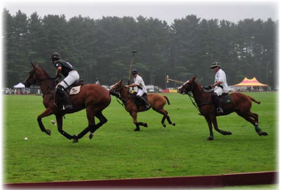
Ah, the Jaguars, the polo ponies and the spectacular hats! Must be Myopia. Since the Myopia Jaguar Cup happened at press time it did not make it into this issue. But never fear, full coverage of the event and more exciting photos will appear in the September Coventry Cat.