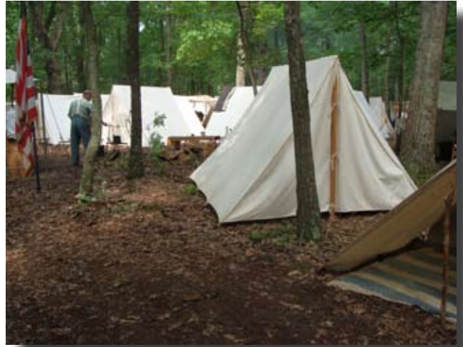
The 3rd Maine encampment, tents as far as the eye could see. There were just under 10,000 total re-enactors participating June 28-30, at Gettysburg.

Friday morning was Day 1 of the battle (July 1, 1863). It was hot and humid, just like the actual day. Each day was to have at least three battle scenarios although we (3rd Maine) would not participate in them all. And I might note that only one day we got