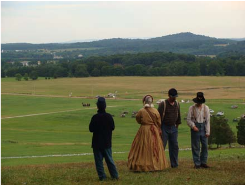
Above: Re-enacting is not allowed on the actual Gettysburg battlefield so the action happens on private property. However, participants got breathtaking views of the Little and Big Round Top off in the distance.

I probably could have stayed at a hotel and spent the whole weekend at the battlefield, there was so much that I did not get to see and learn about. But then I couldn't have said I participated in the 150th anniversary re-enactment.