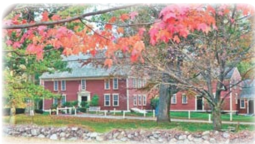
Longfellow's Wayside Inn

Wednesday, August 28, 7pm Wayside Inn, Sudbury, MA