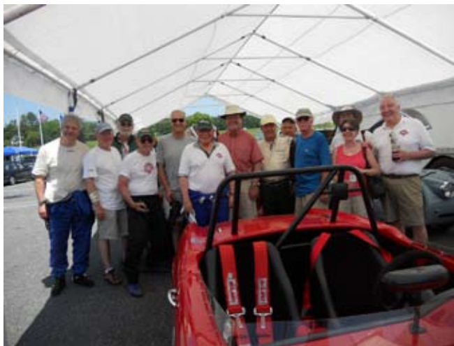
JANE was well represented at the Lime Rock Park Vintage Sports Car Club track day on June 1.