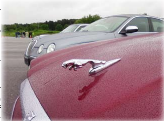
Dedicated slalom enthusiasts wait out the rain in the parking lot before JANE's Spring Slalom.