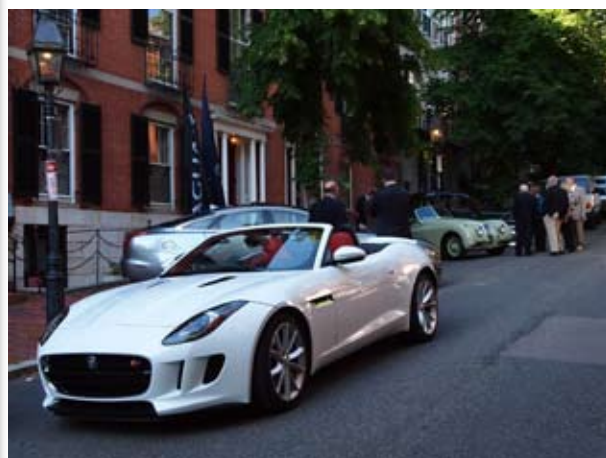
Below: A new F-type provided by the governmental liaison for the US for Jaguar/Land Rover.