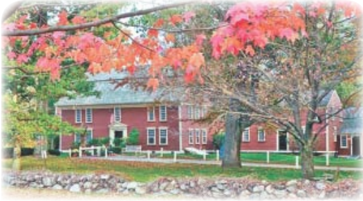
Longfellow's Wayside Inn

Wednesday, March 27, 7pm -- Wayside Inn, Sudbury, MA