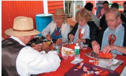
Lobster Feast 2005