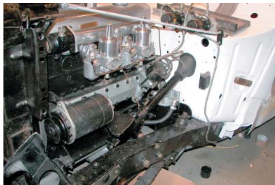
Details of the engine, ready to ship from Nashua, NH

had been used by other JANE members gave me a fair estimate to complete the work, but couldn't guarantee to finish for