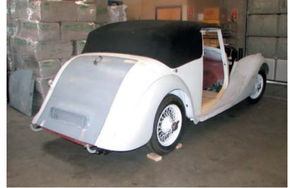
Ready for loading at the East Boston shipper

The flatbed arrived to pick up the car right on schedule, and it