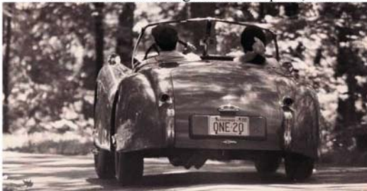
Yurt's XK120 in Hunnewell Hillclimb) 1970