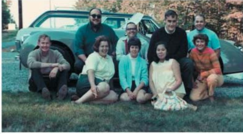
Attendees of 1st Meeting NEXKA Sept 15, 1968