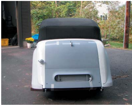
The MK IV rear view, in Nashua ready to depart