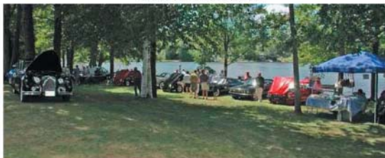
JANE Concours 2006