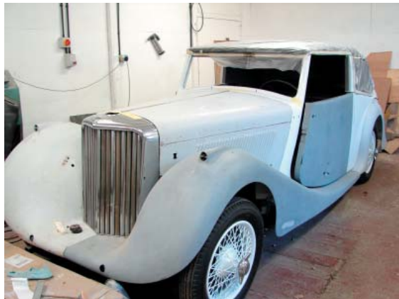
The MK IV as received at Davenport Cars, with doors, hood, and grille parts being aligned

This is called the "commercial invoice" in the trade.