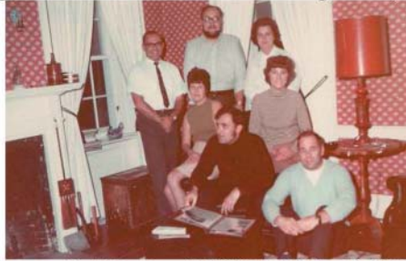
2nd Meeting of NEXKA NH Nov 10, 1968