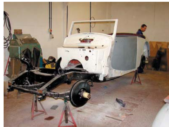
The MK IV at Davenport Cars, with body and engine parts removed for adjustment and work