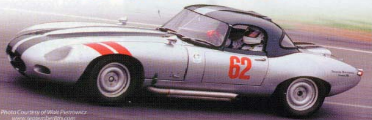
www.spartanberns.com

4 Holmes Road, Lenox, MA 01240 fax (413) 499-6699 www.donovanmotorcars.com • info@donovanmotorcar.com