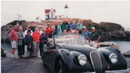
JANE group on tour 2002