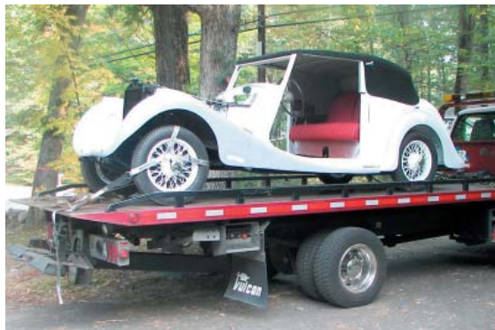
On the ramp truck, headed to the East Boston warehouse

I got estimates from several shippers, and was shocked at the range of prices, which varied from $3250 to $10,500. A couple of estimates were close to each