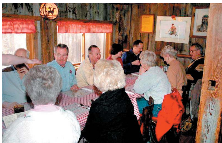
A scene from brunch last year at Parker's Maple Barn

So don't be a fool—join the gang for our first driving event of the year on April 1st! 🍷