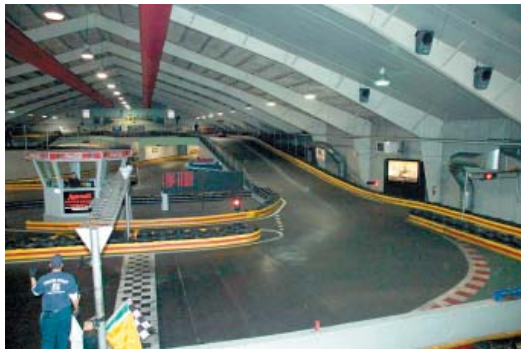
The scene of the action - F1 Boston's City Track