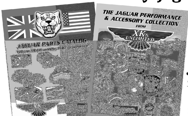
384 page Vol. XII, Jaguar Parts Catalog