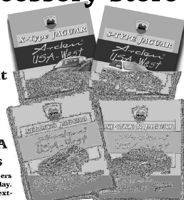
Full color Arden® brochures for XKE, XJ8, S-TYPE AND X-TYPE

* XKs' normal policy is to fill and ship orders received before 2:00 pm, Pacific time, the same-day. Unforeseen circumstances may cause delays, next-day shipping may result in some cases.