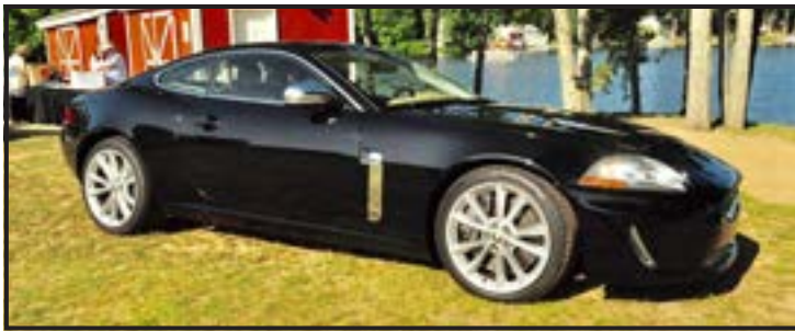
Driven D11/XK: Allen Sojka, 2011 XKR Coupe