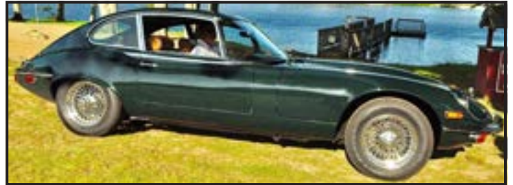
Driven D4/E3: John Champagne, 1971 E-Type Series 3 2+2 Coupe