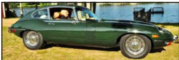
Driven D3/E2: Vincent and Marion Barre, 1970 E-Type Series 2 2+2 Coupe