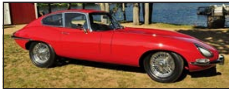
Championship 5/E1: Eric and Daryl Hagopian, 1967 E-Type Series 1 FHC