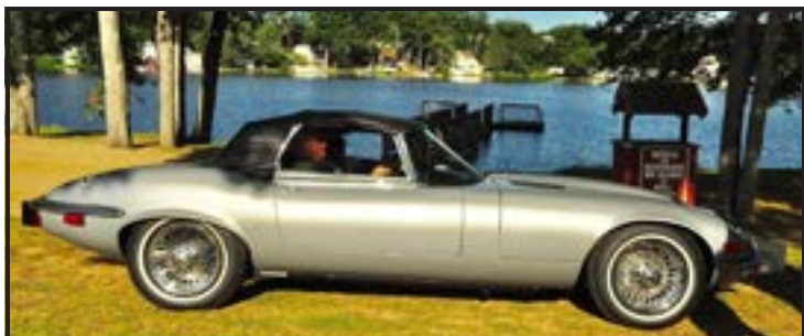
Championship 7/E3: Nancy Coombe-Smith, 1974 E-Type Series 3 OTS