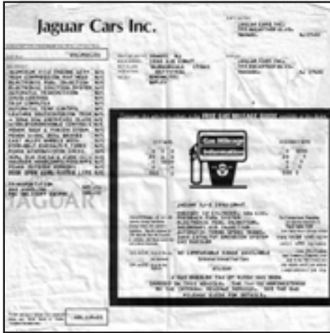
Pix of XJS sticker labeled: XJS

I learned that if he had a car's VIN he could find what options had been offered or included. But, fortunately for me, I had a copy of the actual vehicle invoice from the dealer and it contained all the details and relevant information about my XF. So, I sent it and approximately two weeks later a package arrived inside of which was a laminated sticker and an un-laminated one. The new window sticker looks great and even has some crease marks as if it had been folded.