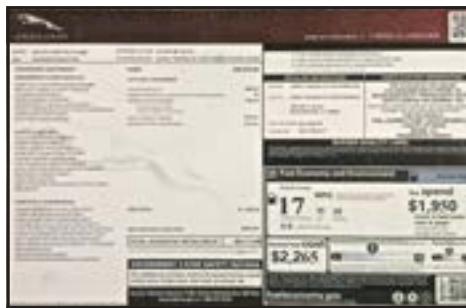
Pix of XF window sticker labeled: After

So, if you think you might like a really well done, reproduced, window sticker you can contact Howard Meyers at WindowStickers100@aol.com . The price is $35 and will include one laminated and one un-laminated sticker. If you don't have any information about your car, he can use the VIN to obtain information and then either use a picture of your car or information you send him, to fully develop the sticker. Otherwise, you may be able to get useable information from the Jaguar Heritage Trust ( www.jaguarheritage.com/archive-services/certificates/ ).