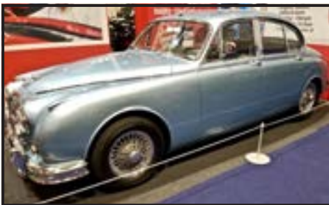
A lovely light blue Jaguar Mark II