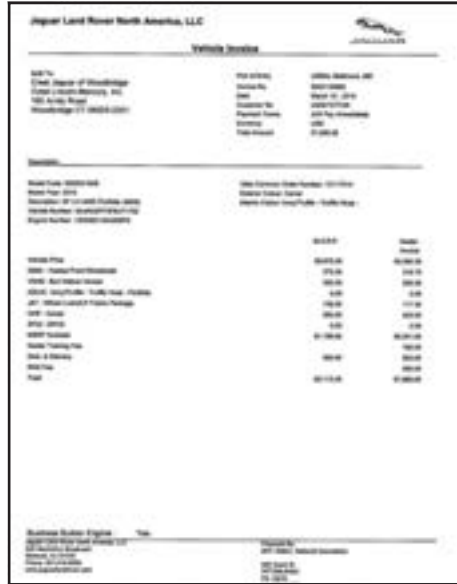
Pix of XF invoice labeled: Before

I learned that if he had a car's VIN he could find what options had been offered or included. But, fortunately for me, I had a copy of the actual vehicle invoice from the dealer and it contained all the details and relevant information about my XF. So, I sent it and approximately two weeks later a package arrived inside of which was a laminated sticker and an un-laminated one. The new window sticker looks great and even has some crease marks as if it had been folded.