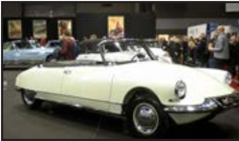
1965 Citroen DS21 Cabriolet by body designer Chapron