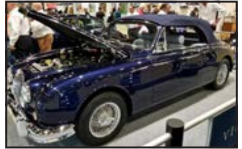
A very rare Mark II convertible