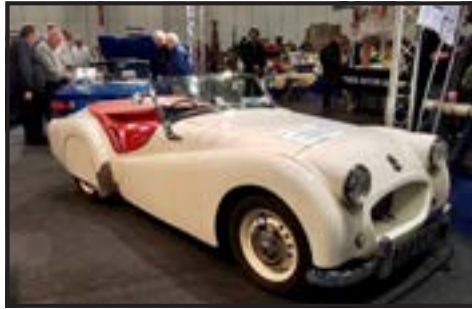
The first pre-production right-hand drive TR2 from 1953