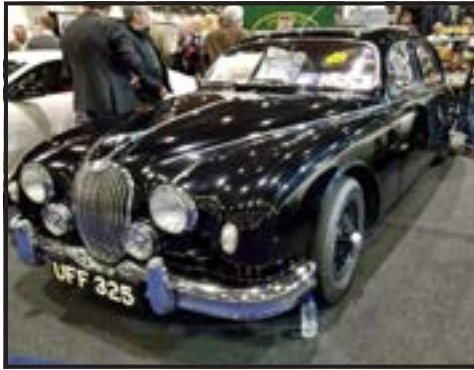
Inspector Morse's first Jag

There were many cars for sale. A 1928 Rolls Royce Phantom 1 was listed for 120,000-140,000 pounds. For 8,000 -10,000 pounds you could be the proud owner of a 1968 Jaguar 420G Estate. And a 1979 Bentley T2 cost only 110,000 - 130,000 pounds. Finally, a 1986 Jaguar XJ-S could be purchased for 10,000 - 15,000 pounds.