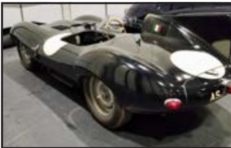
A Jaguar C-Type after a quick run down Grand Avenue