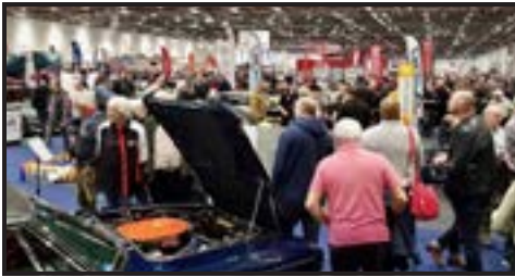
The London Classic Car Show gets underway

On February 14, the day announced itself with a sky that resembled polished steel and the London Classic Car Show opened its doors to 4,000 car enthusiasts and collectors from around the world.