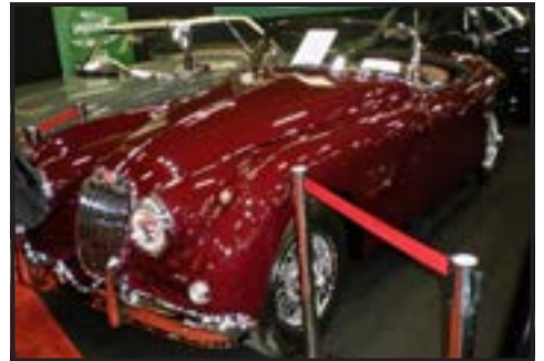
An XK150 OTS