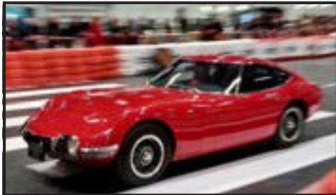
A rare Toyota 2000 GT on the show track, also known as Grand Avenue, where you could see and hear the cars in action.

There were many cars for sale. A 1928 Rolls Royce Phantom 1 was listed for 120,000-140,000 pounds. For 8,000 -10,000 pounds you could be the proud owner of a 1968 Jaguar 420G Estate. And a 1979 Bentley T2 cost only 110,000 - 130,000 pounds. Finally, a 1986 Jaguar XJ-S could be purchased for 10,000 - 15,000 pounds.