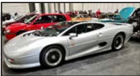
An XJ220 (sigh!)