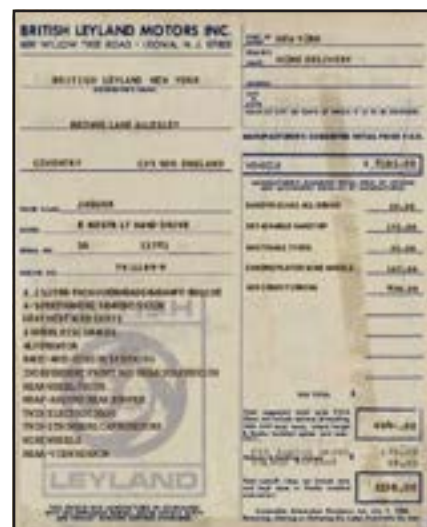
Pix of E-Type sticker labeled: E-Type

I learned that the new widow sticker would also appear authentic because he starts with scanning an original so all imperfections are retained (e.g., if the original had a crease from being folded, that crease would appear when a sticker was produced with the new information). I also found out that he has stickers for the E-Type, all Jaguars from 1982-1990, as well as those from 2001-2017. It turns out that the same stickers were always used by Jaguar and that versions can be created for the XE, XF, XJ, XJS, XK8, and even an F-Type.