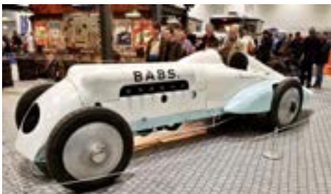
Babs (AKA Chitty Bang Bang 4), the ill-fated land-speed record car that held the world land speed record (at 171 mph) in 1926, but crashed a year later, killing driver Parry Thomas. It was then destroyed and buried, and then, beginning in 1969, resurrected and restored.