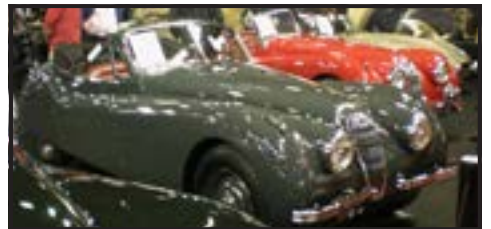
And more Jags, on and on . . .

If you are interested in motor memorabilia, classic car automobelia, books, badges, posters, kiddie cars and even designer perfumes, there were booths to meet your every desire.