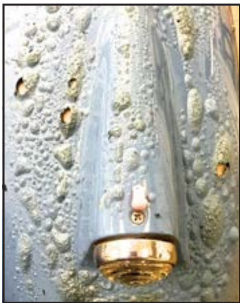
Detail of the paint blistering on the left-front wing.