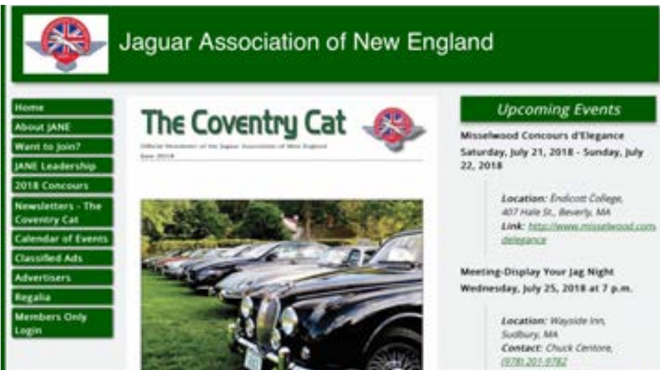
Our current home page