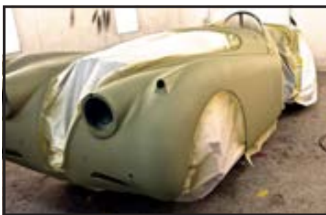
Primer on . . .

Around April of 2016, the car was delivered to Paint By Dillon in Ashland, VA, who had signed on at the beginning to do the paint and bodywork.