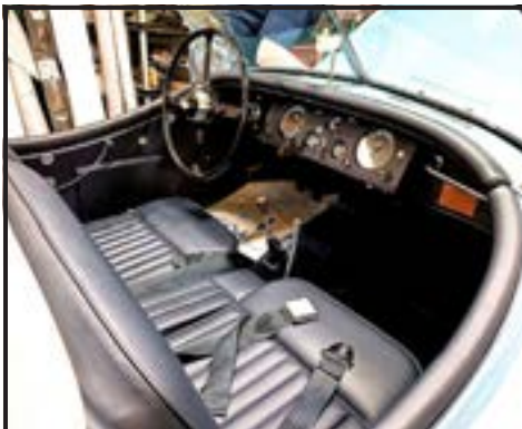
The interior, after the Gassman Automotive work is completed.