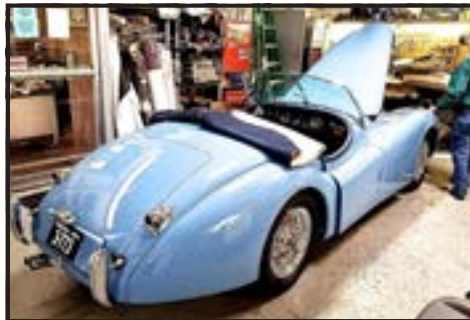
The XK-120 nears completion . . .

Finally – she was done! On December 7, a fellow-CVBCC member and I went down to look it over and see what else needed to be done. We developed a very short "punch list" – rear lights didn't work, mod to tonneau cover for better fit, and few other small items. When it was done, I arranged payment – my part for a few items (like carb rebuild) not related to fire damage, and Hagerty's for the rest. Again, to Hagerty's credit, they covered all of the fire-related bills with no issues whatsoever.