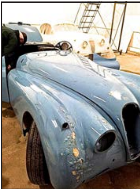
The restoration begins.