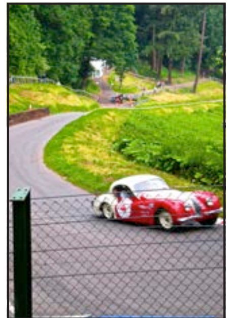
. . . picking up the pace a little at Shelsley in the afternoon . . .

“We shall never be as we were.” Those of us who gathered on the two-day, sun-soaked Jaguar XK70 Festival, certainly will never again be quite the same as we once were. I don’t know how many cars participated in the hillclimb and I don’t know which car won. What I do know is that for two days the unmistakable lovely sound of that historic and brilliant XK engine filled the air in Shelsley Walsh and we were once again 25 years of age with life ahead of us, full of promise and adventure.