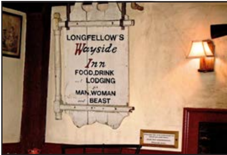
The Way It Really Was Way Back When . . .