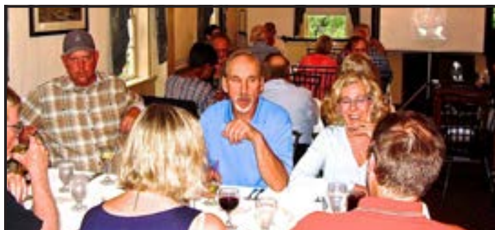
JANE members doing what we do best.