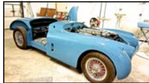
The body is now mostly painted . . .