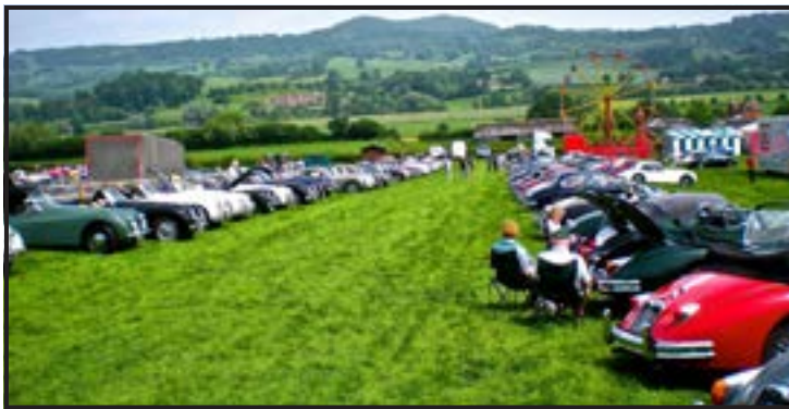
In Shelsley Walsh, a few of more than 400 Jaguars!

Foremost in the minds of those of us fortunate enough to gather in Shelsley Walsh to celebrate the 70 th anniversary of the XK engine and the three classic sports cars it engendered – the XK120, 140, 150 – was the joy of seeing more than 400 classic Jaguar cars and meeting many of their owners. We gathered from all parts of the world to remember and celebrate the XK engine and these historic cars that have motored so wonderfully through time.