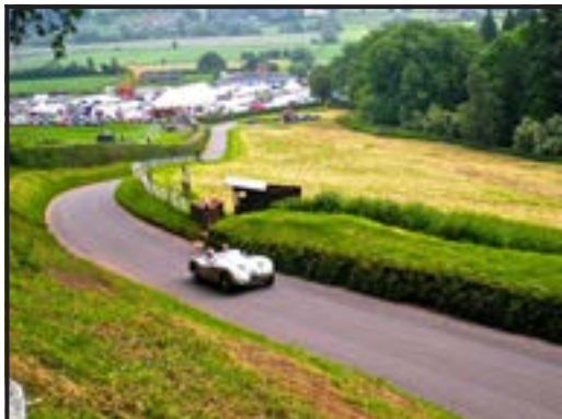
A nice Sunday morning drive up the hill at Shelsley Walsh . . .

This article is not an elegiac description of a long-lost bygone day. Nor is it a technical article – my limited knowledge and understanding of the mechanics of the XK engine prevents that. Rather it is my wish to bring you, the reader, to the 113-year-old motorsport venue, Shelsley Walsh in the West Midlands of the UK, the venue where Sir Stirling Moss first competed in 1948, just after his 19 th birthday (he won). This is my attempt to paint a quick impressionist vision of the two-day celebration at that wonderful venue. Shelsley Walsh, according to Sir Stirling, is the best known and