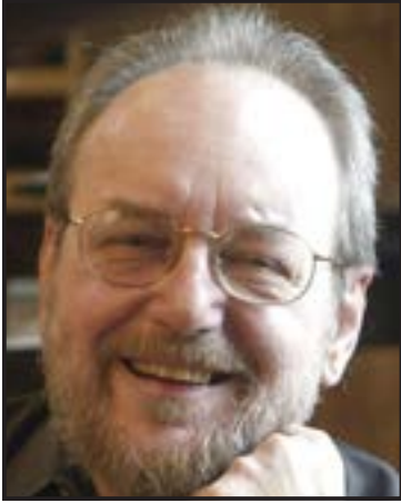
The editor, thinking about 4 PM, a Perfect Martini and lounging in the Pergola. Retirement isn't all bad.