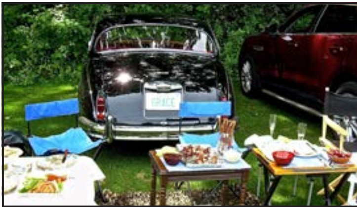
Grace has a nice spread laid out, courtesy of Bonnie Getz.