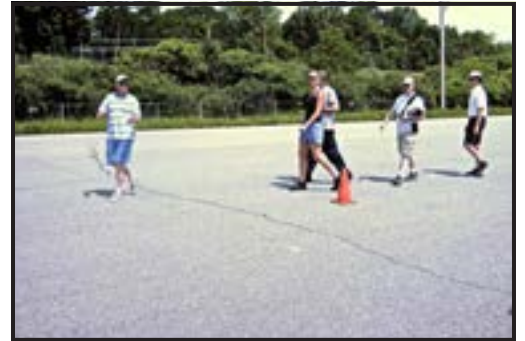
The cars take a breather while the humans go around the course