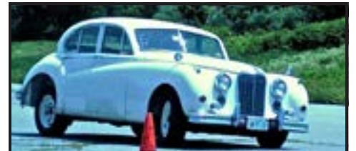
Now Adrian is up to full steam, er, Pace, and preparing to go hard-to-starboard.