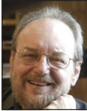
The editor, trying to learn how to drive autonomously.

• High-resolution mapping is a vexing problem, because streets vary so much and so often. At present, such streets apparently need to be remapped several times a day for safe operations, and street and lane