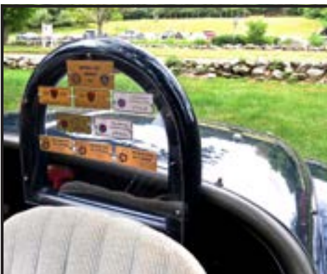
Cheaters never win, do they?