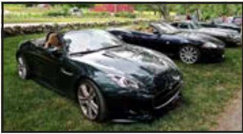
Despite cloudy weather, JANE's optimistic OTS owners all drove top-down to Sudbury.