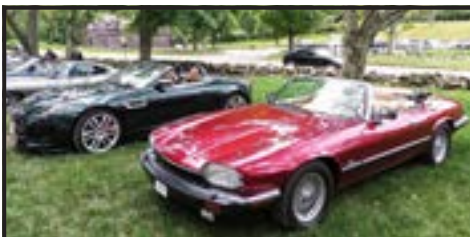
Like shipboard running lights, a red XJS is to port of the green F-Type to starboard.