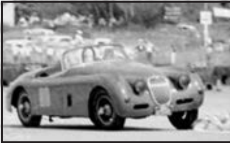
"Almost An XK150" in a suspected former life as a race car.

I also discovered cut off ends of a unique roll bar brazed onto the floor directly behind the driver seat. This car obviously had been a very serious race car because the roll bar had been made of exhaust tubing! Innovative racers used exhaust tubing rather than steel pipe to save weight. Also this roll bar had been no wider than the driver's seat, saving even more weight. The few other XK150s being raced had roll bars that spanned the full width of the cockpit. Being more interested in cannibalizing its parts, I never even saved the chassis number of my 'Almost An XK150'. I would regret this many years later when trying to confirm its racing history. I suspect it was the car raced by Harry Carter seen here at Montgomery AFB in August 1958 where he finished 2nd Overall and first in Class CP.