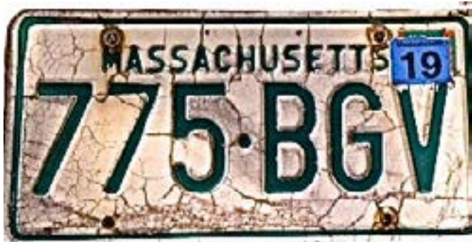
MA 775•BGV before

Well, did you keep that plate and do you still use it on your car? Is it getting kind of weathered, faded, and cracked?