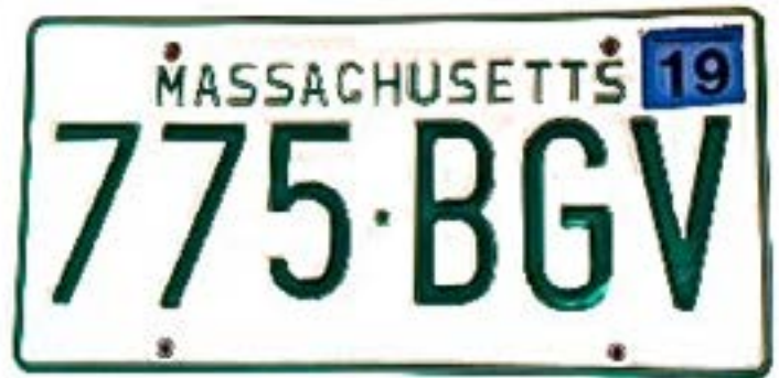
MA 775•BGV after