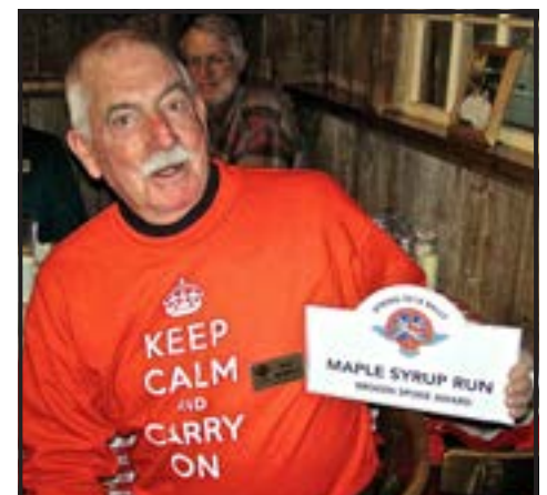
Your Humbled Humble Correspondent

Your humble correspondent was further humbled to receive the coveted "Broken Spoke Award," which was easy to attain after my careful reading of the rally rules, that posited sharing a hearty lunch with your JANE friends that took priority over wandering around until the run was eventually completed. It is popularly understood that Winston Churchill said that "History is written by the victors," so I am pleased to provide the exception to this rule with this Coventry Cat article.