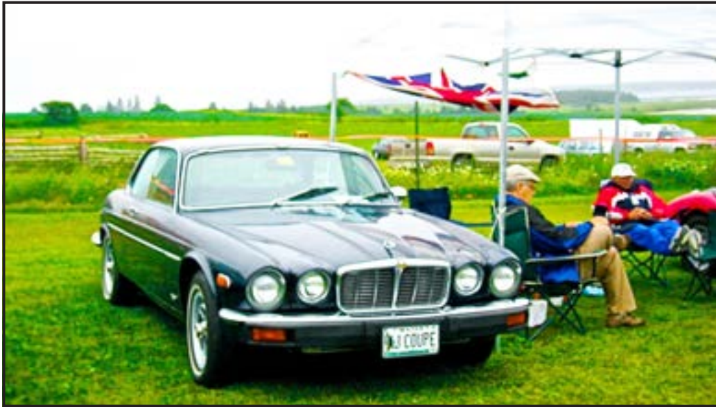
The object of our affections, and our reason for joining JANE